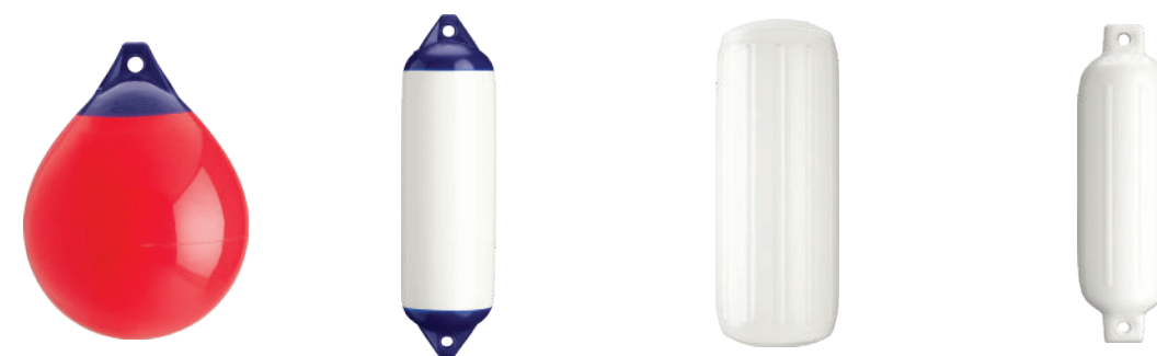
Polyform US A Series Polyform US F Series Polyform US HTM Series Polyform US G Series

POLYFORM US These inflatable PVC fenders and buoys, manufactured by Polyform US, made in the USA, using a seamless construction, are the strongest fenders on the market.