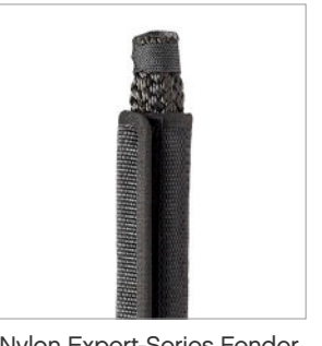
Nylon Expert-Series Fender Line Protectors